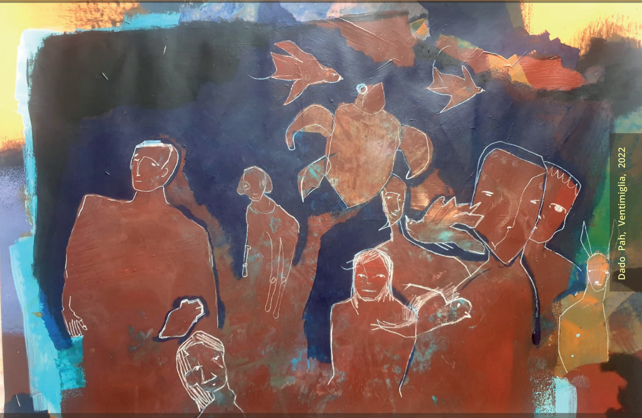
Dado Pah, Ventimiglia, 2022